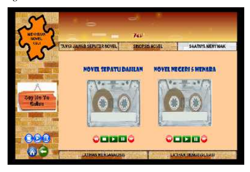
Figure: Display of teen novels in interactive multimedia

Furthermore, the test of student learning outcomes in the first cycle was carried out during the last 30 minutes of class hours.