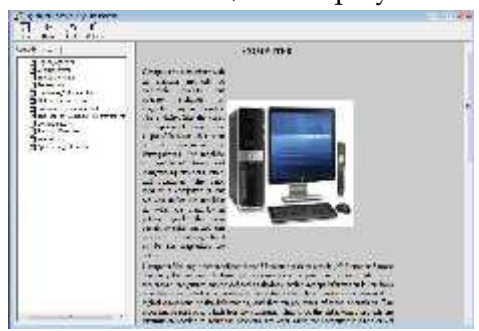
Figure 2 Contents and Index Menu

Main menu is user interface display from E-book. It consists of 12 topics from English for computer materials such as reading, grammar, listening and language functions. This main menu has 4 bar menu dan 2 tab menu. The next is contents and index menu, the display can be seen below.