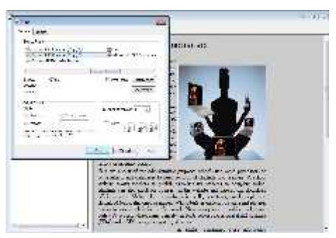
Figure 3 Print Topic Menu

The 1st Multi-Discipinary International conference University Of Asahan2019 Thema: The Role of Science in Development in the Era of Industrial Revolusion 4.0 based on Local Wisdom." in Sabty Garden Hotel-Kisaran North Sumatra, March 23<sup>rd</sup>, 2019