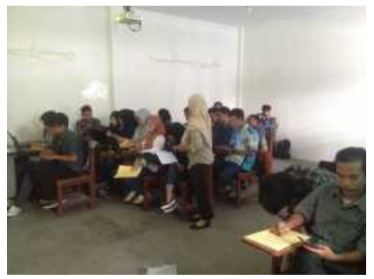
Figure 4 Learning English by Using E-book

E-book is a learning material to be used both lecturer and students. It can be accessed by using laptops and handphones. the application was easy and interactive to use, so that the students is interested and motivated to learn English. The interaction of teaching learning English by using E-book can be seen below.