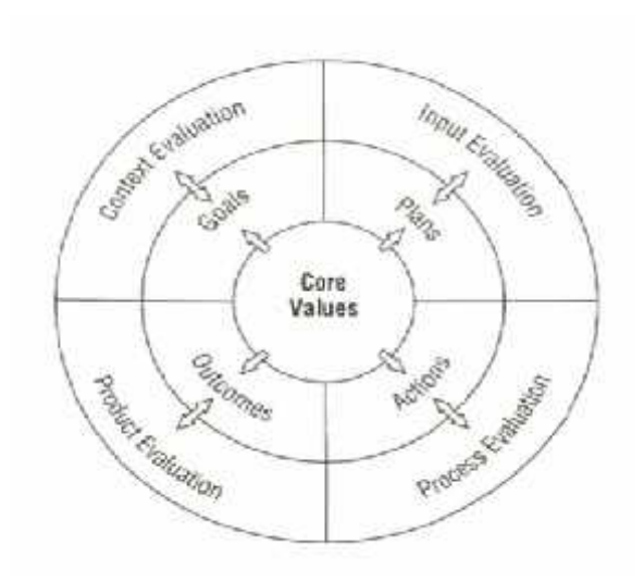
Figure 1: Key Components of CIPP's Evaluation Model Regarding the Program.

The CIPP model in principle helps decision making, the focus is on program improvement.(Fitzpatrick et al., 2011) Means, done to improve the effectiveness of the program by modifying the program. The key component of the CIPP evaluation model is related to the program forming the "Stufflebeam Circle" which describes the influence of core values at each evaluation stage as the following illustration in the Figure 1. (StufflebeamandCoryn: 2014).