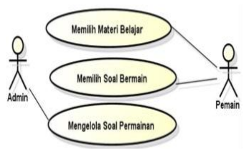
Table 3. Defining Use Case

A use case should describe a job where the job will provide useful information to the actor.