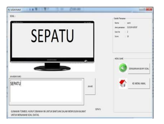
Table 5. Use Case Scenarios for Choosing Playing Questions