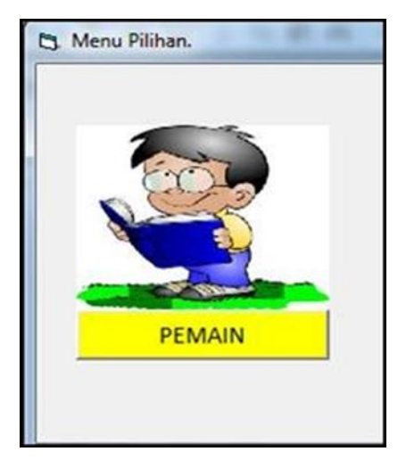
Figure3. Main menu Game

Figure 3 above is the main menu that will be accessed by players. Admin menu can only be accessed by admin on here is the guardian class by logging in using your username and password to gain entry into the processing pages about the game. On the player menu that is accessed by the user, there is a menu page that contains a menu of options in the game process. To make it clearer, the author presents the player sub menu display as follows.